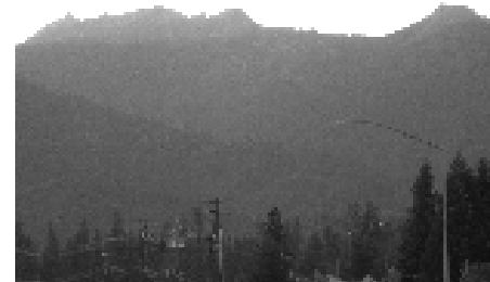
In the shadow of mountains Weaverville, California

The Void which is the absence of Being exists and Contains no Law. The Void may be regarded to be Part of every element of Being.