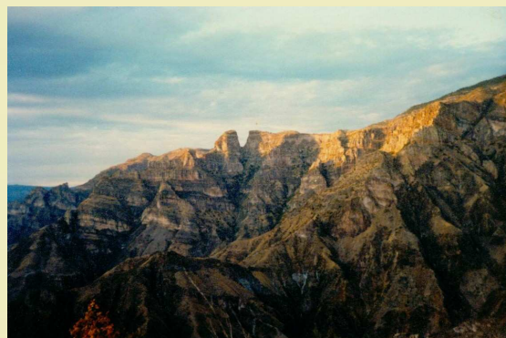
Barranca del Cobre, Mexico

Pictures in the text show places of inspiration.