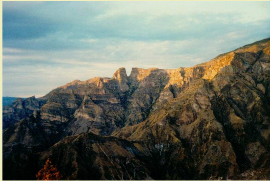
Barranca del Cobre, Mexico

Pictures in the text show places of inspiration.