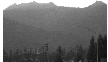
In the shadow of mountains Weaverville, California

The Void which is the absence of Being exists and Contains no Law. The Void may be regarded to be Part of every element of Being.