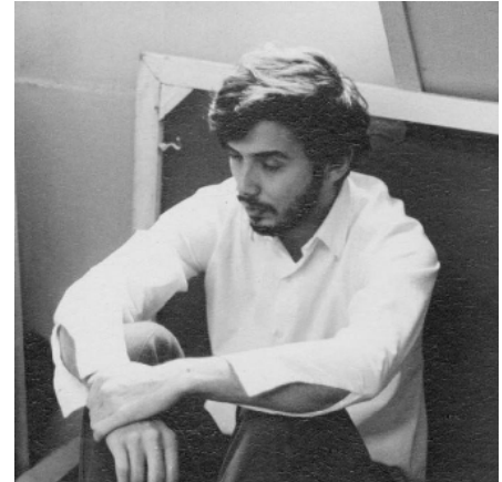
Author, Delaware, 1973 By M.D. Greenberg

Nature pictures in the text show places of inspiration and realization.