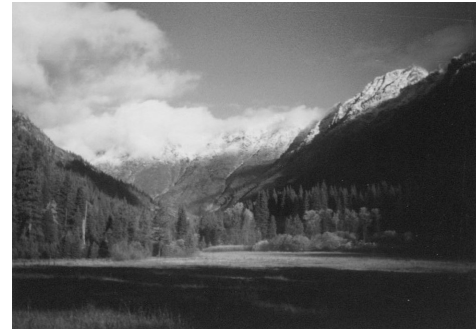
Morris Meadow Trinity Alps, California

The Universe has and must have manifestation and Identity In acute, diffuse and absent phases.