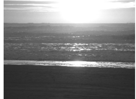
Pacific Ocean Humboldt County, California

In foundation in Experience and Being the metaphysics is Perfect. From expression as Logic it is unique—as container of All special metaphysics; and ultimate—in complete but partially Implicit capture of the variety, extent, and duration of Being.