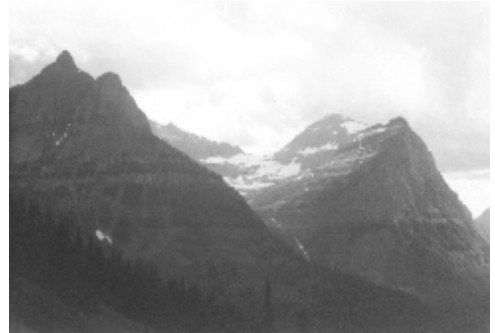
Glacier National Park Montana

Ultimate realization for all beings is given By the metaphysics. However, efficiency and enjoyment Are immensely enhanced in occurrence and quality By commitment and engagement.