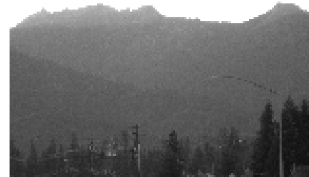
In the shadow of mountains Weaverville, California

The Void which is the absence of Being exists and Contains no Law. The Void may be regarded to be Part of every element of Being.