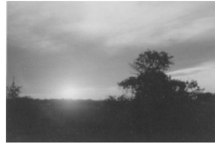
Sunset Bear, Delaware

Any metaphysics that agrees with standard cosmologies— And their principles of reasoning—in their domains of Validity is allowed by those cosmologies and principles.