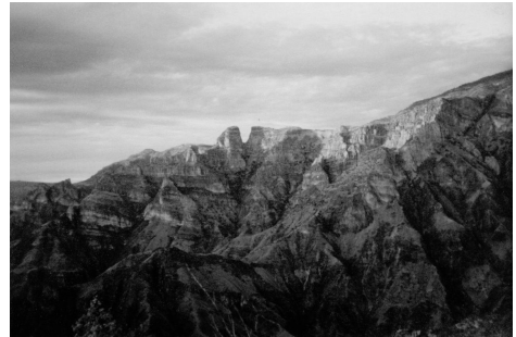
Barranca del Cobre, Mexico (Copper Canyon)

Meaning is sometimes seen as fixed—but has no final Determination outside process. New experience and established Use balance fluidity and fixity in setting meaning.