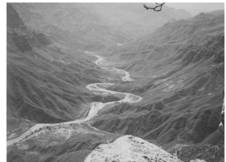
Rio Urique Barranca del Cobre

Nature pictures in the text show places of inspiration and realization.