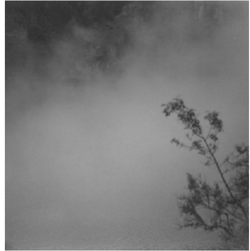
Storm Barranca del Cobre

The object of Realism (Logic) is the Universe. All valid science and Systems of logic lie within Logic. Universal metaphysics and science Have no conflict. Just as the Universe is all Being, so the metaphysics Is an envelope for all knowledge including science.