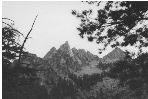
Cirque above Papoose Lake Trinity Alps, California

While in limited form realization is endless process And ever freshness in variety—A Journey in Being.