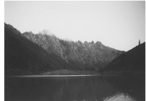
Papoose Lake Trinity Alps, California

The places of realization are the Ground—nature—and Fabric—individual, society and culture—of Being and Civilization which link the immediate to the ultimate.