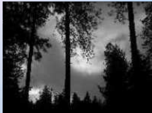
Trinity Alps—Storm from a Gap in the Trees

The author and his inspiration —I live in Northern California. I love to backpack in wilderness areas. The photographs in Journey in Being show places where I have had much inspiration for the ideas of this book.