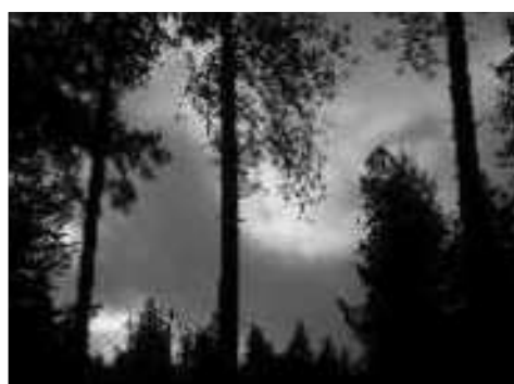
Trinity Alps—Storm from a Gap in the Trees

The author and his inspiration —I live in Northern California. I love to backpack in wilderness areas. The photographs in Journey in Being show places where I have had much inspiration for the ideas of this book.