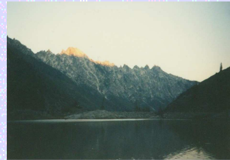
Papoose Lake Trinity Alps, California

The places of realization are the Ground—nature—and Fabric—individual, society and culture—of Being and Civilization which link the immediate to the ultimate.