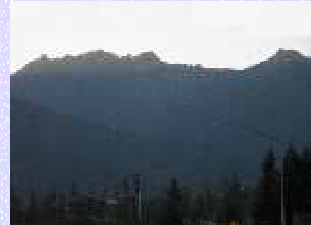
In the shadow of mountains Weaverville, California

The Void which is the absence of Being exists and Contains no Law. The Void may be regarded to be Part of every element of Being.