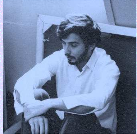
Author, Delaware, age 26