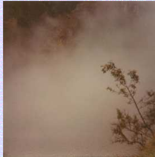
Storm Barranca del Cobre

The object of Realism (Logic) is the Universe. All valid science and Systems of logic lie within Logic. Universal metaphysics and science Have no conflict. Just as the Universe is all Being, so the metaphysics Is an envelope for all knowledge including science.