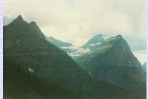
Glacier National Park Montana

Ultimate realization for all beings is given By the metaphysics. However, efficiency and enjoyment Are immensely enhanced in occurrence and quality By commitment and engagement.