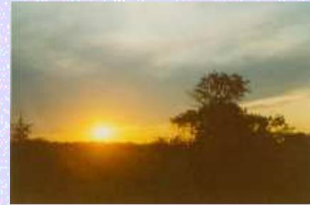
Sunset Bear, Delaware

Any metaphysics that agrees with standard cosmologies— And their principles of reasoning—in their domains of Validity is allowed by those cosmologies and principles.