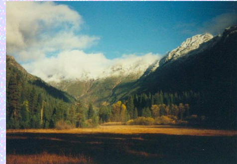
Morris Meadow Trinity Alps, California

The Universe has and must have manifestation and Identity In acute, diffuse and absent phases.