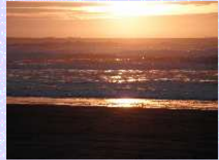
Pacific Ocean Humboldt County, California

In foundation in Experience and Being the metaphysics is Perfect. From expression as Logic it is unique—as container of All special metaphysics; and ultimate—in complete but partially Implicit capture of the variety, extent, and duration of Being.