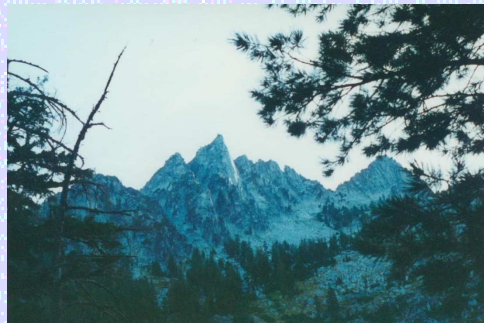
Cirque above Papoose Lake Trinity Alps, California

Living in transience, its joy and anxiety, is on the way—is Essential to realization, ever a flux of transience and arrival. While in limited form realization is endless process And ever freshness in variety—A Journey in Being.